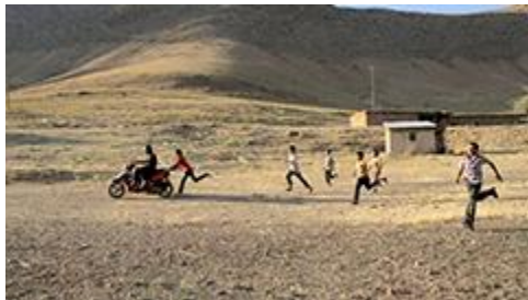
ICE CREAM (dir. Serhat Karaaslan)

Two stories set inside a cafe in Kolkata, India follow the conversations of an elderly couple who have met by chance after a long interval, and a younger couple who are meeting for the last time.